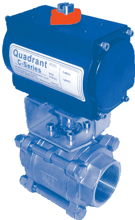
2" M1-SS with Quadrant C-Series Actuator