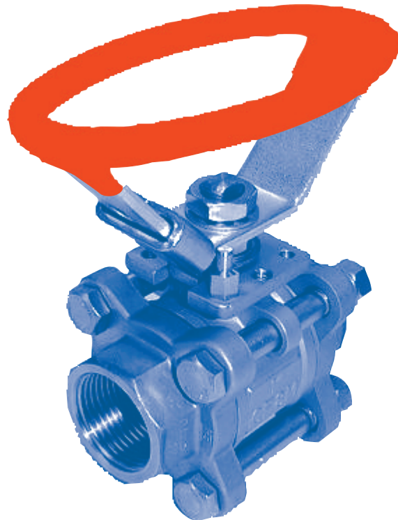
1" M1-SS with 304 SS Locking Oval Handle